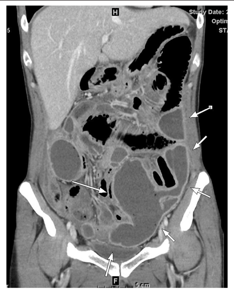
Figure 1 Abdominal computed tomography (CT) scan. An abdominal CT scan showed a massive abscess occupying a significant portion of the intra-abdominal cavity. A well-circumscribed abscess fluid collection with enhanced walls are seen as pointed by the white arrows.

construct the neovagina. The patient had no major complications other than mild stenosis of the neovagina and was advised by her primary surgeon to undergo vaginal dilation via daily insertion of plastic stents (2-4\times20\text{cm}) 10cm into her neovagina. The patient stated that she had vaginal intercourse and vaginal dilation a few days prior to the onset of her symptoms.